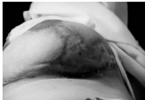
Fig. (2-B): Hypertrophic scar at the T-junction after healing of massive sloughing.