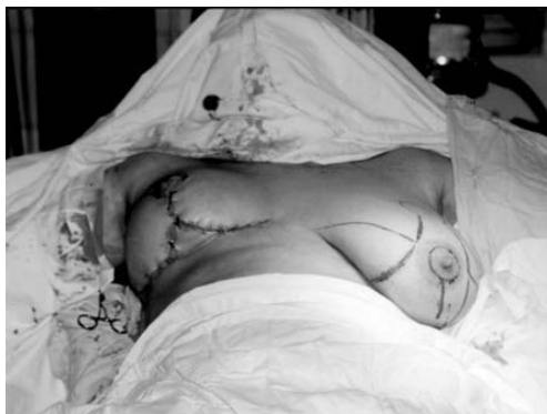
Fig. (3-A): The inframammary triangle as previously described.