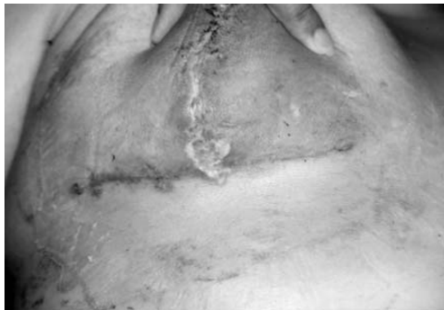
Fig. (2-A): Skin sloughing occurring at the T-junction after reduction mammoplasty.