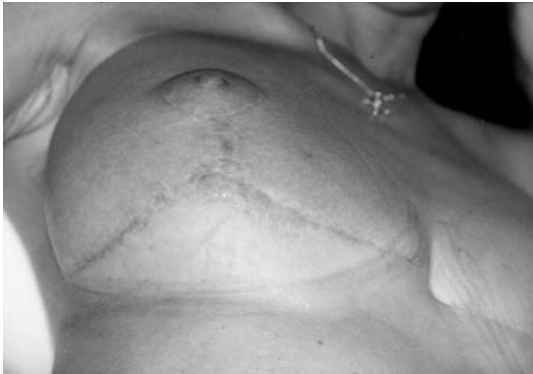
Fig. (4): Late postoperative photo of the same patient with inframammary semilunar incision.