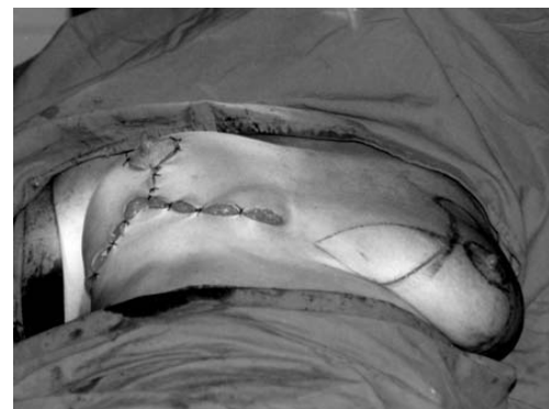
Fig. (3-B): The inframammary semilunar incision as a modification of the inframammary triangle.