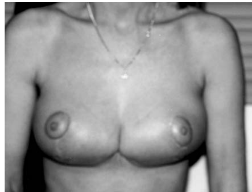
Fig. (5): Broad breasts due to inadequate approximation of the medial and lateral flaps.